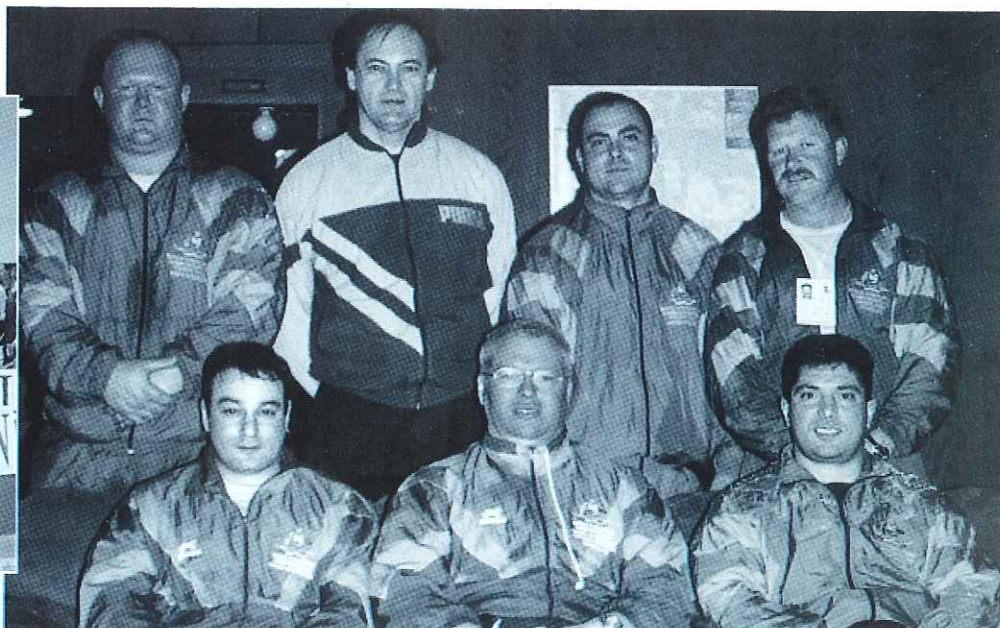
The Australian Team at the Mens World Championships