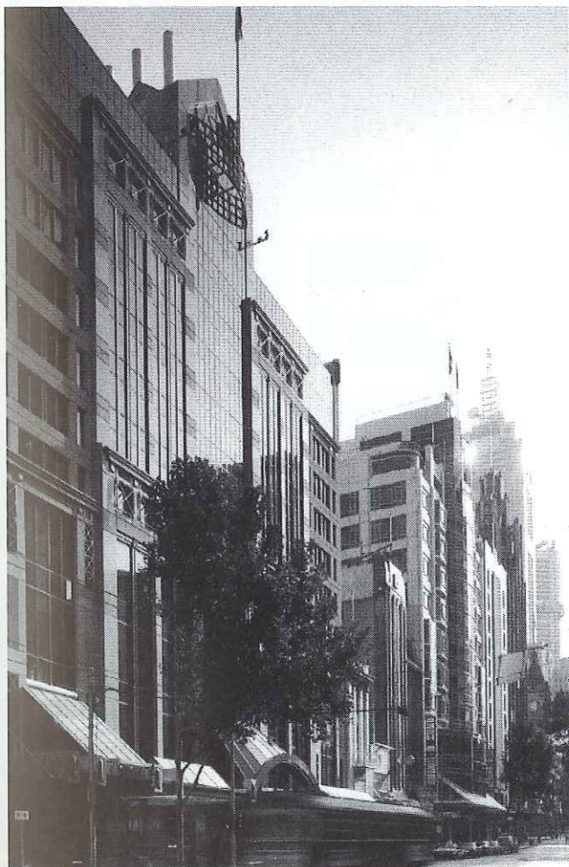
NOVOTEL HOTEL - MELBOURNE